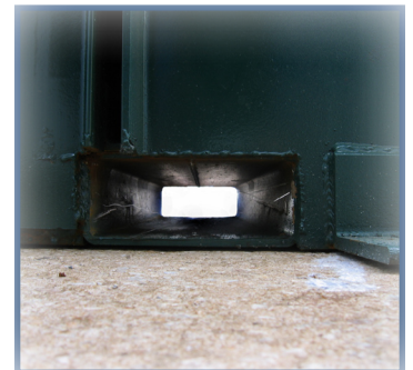
Built-in fork lift pocket for ease of transport and installation of baler.