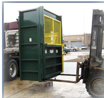
Baler being loaded on a standard flatbed by a fork lift.