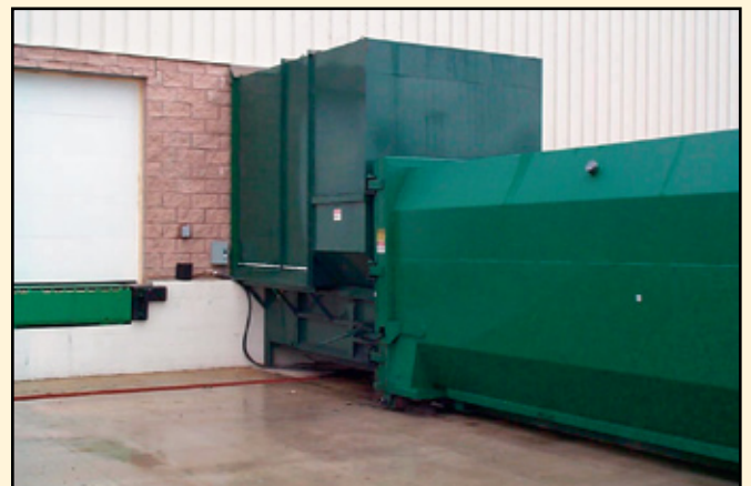
Model 245HD/WQ with 8 Foot Wide Drive on Deck and Hinged Access Gate with Interlock Switch becomes a Full Weather Enclosure.