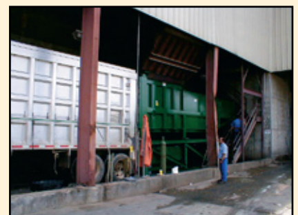
10 Yard Transfer Packing into Trailer