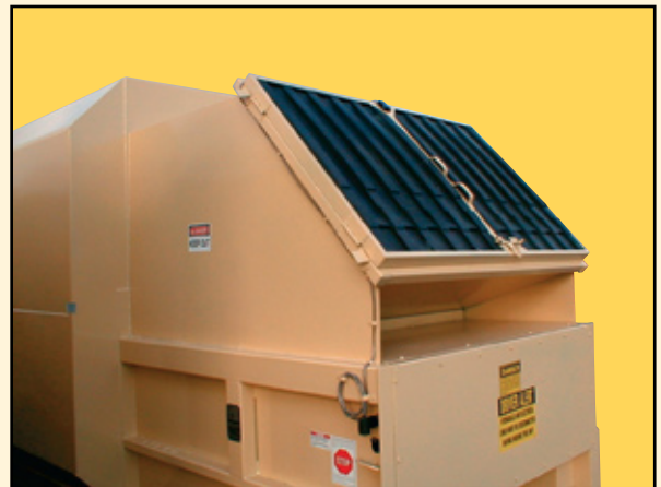
Rear Feed Double Door Doghouse with Plastic Lids