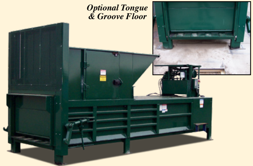
Optional Tongue & Groove Floor

(Pictured here with Side Feed Access Door)