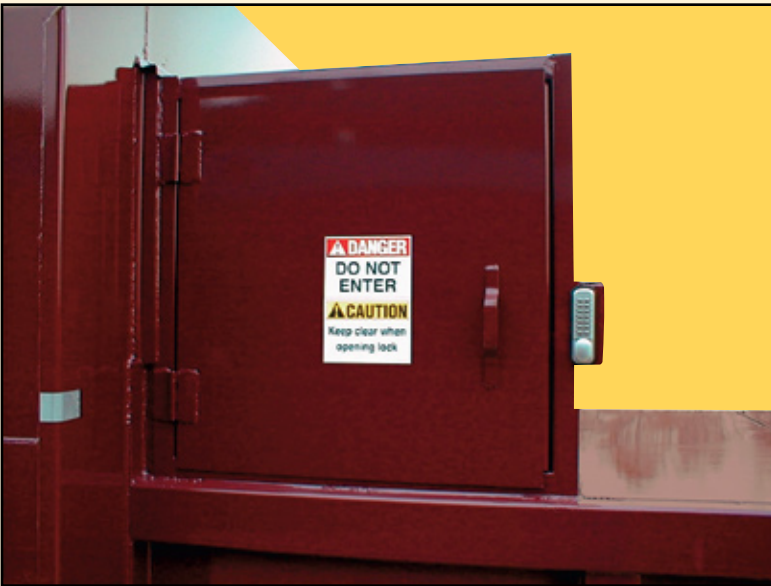
Ground Feed Doghouse with Mechanical Door Lock

Typical installation of self contained compactor working with one yard tilt truck style cart dumper.