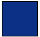
No. P1015 Medium Blue