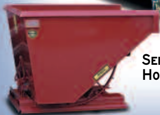
SELF DUMPING HOPPER