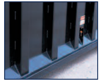
DIRT SHEDDERS AVAILABLE ON R MODEL CONTAINERS (OPTIONAL).