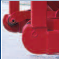
SOLID STEEL NOSE CONE ADDED TO CONTAINER LONG SILLS TO REDUCE IMPACT DAMAGE AND EASE ALIGNMENT FOR LOADING (STANDARD).