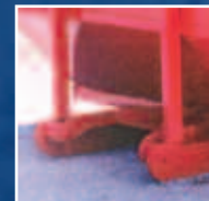
STANDARD OUTSIDE RAIL UNDERSTRUCTURE