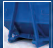
HOOKLIFT STYLE UNDERSTRUCTURE (OPTIONAL)