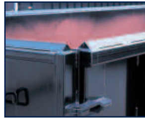
INVERTED ANGLES ON TOP CAP TO REDUCE DAMAGE FROM FALLING DEBRIS. AVAILABLE ON R MODEL CONTAINERS (OPTIONAL).

These tough workhorses are engineered with an outside rail understructure that makes them ideally suited for hauling refuse and scrap material. Extra heavy-duty models are also available for construction and demolition applications. Additional options can be added for specific requirements.