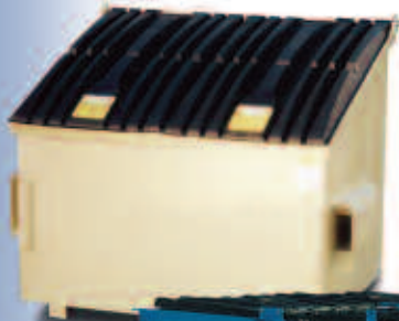
FRONT LOAD CONTAINER