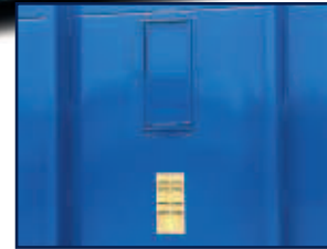
COMPACTION CONTAINER FRONT INSPECTION DOOR (STANDARD).