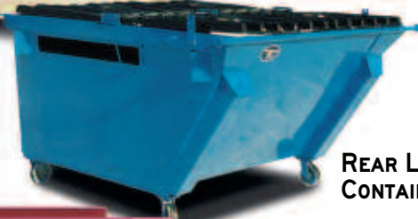
REAR LOAD CONTAINER