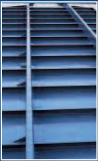
GALBREATH CONTAINER UNDERSTRUCTURE.