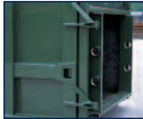
HINGES, GRAB POCKET, AND SPEAR TYPE DOOR ON COMPACTION CONTAINER (AVAILABLE).