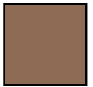
No. P1009 Beige