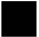
No. P1004 Black