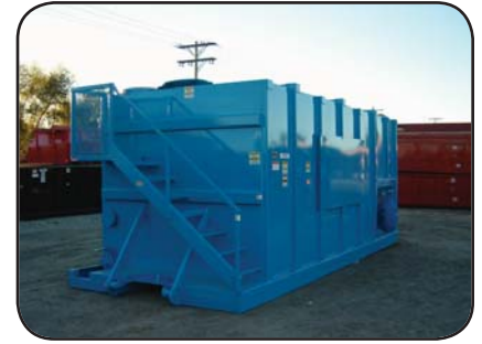
Container shown here with optional stair case