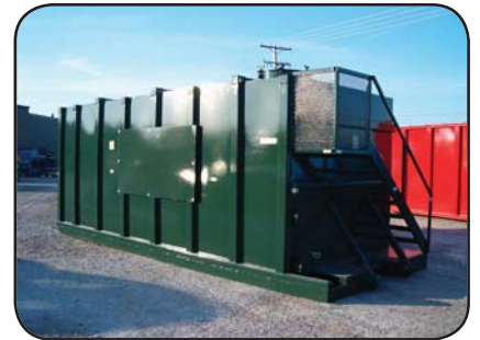
Container shown here with optional sign plate