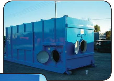
Two 24" manways standard