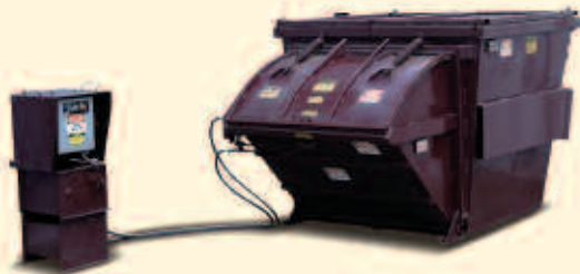
Front Load Pak Man