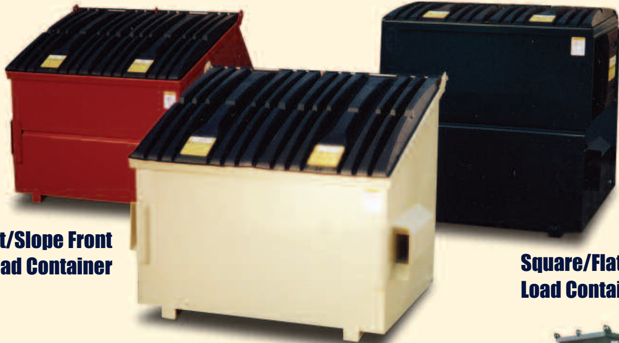
Slant/Slope Front Load Container