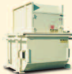
Accu-Pak Vertical Compactor