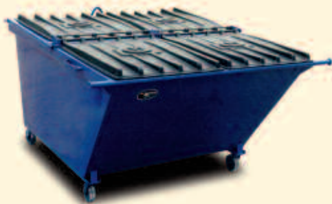
Rear Load Container