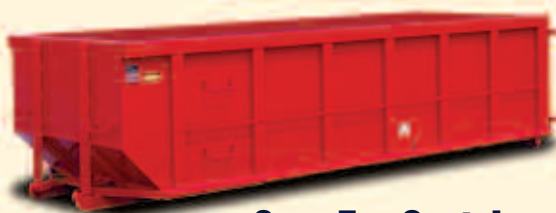
Open Top Container