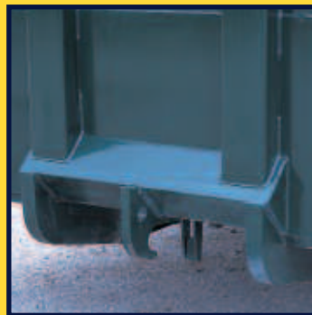
Bale Style Understructure (Optional)