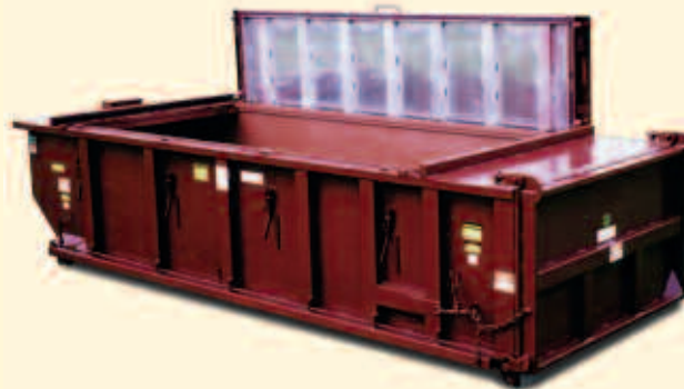
Sludge Container With Movable Lid