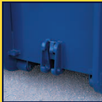
Deadlift Style Understructure (Optional)