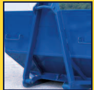
Hooklift Style Understructure (Optional)